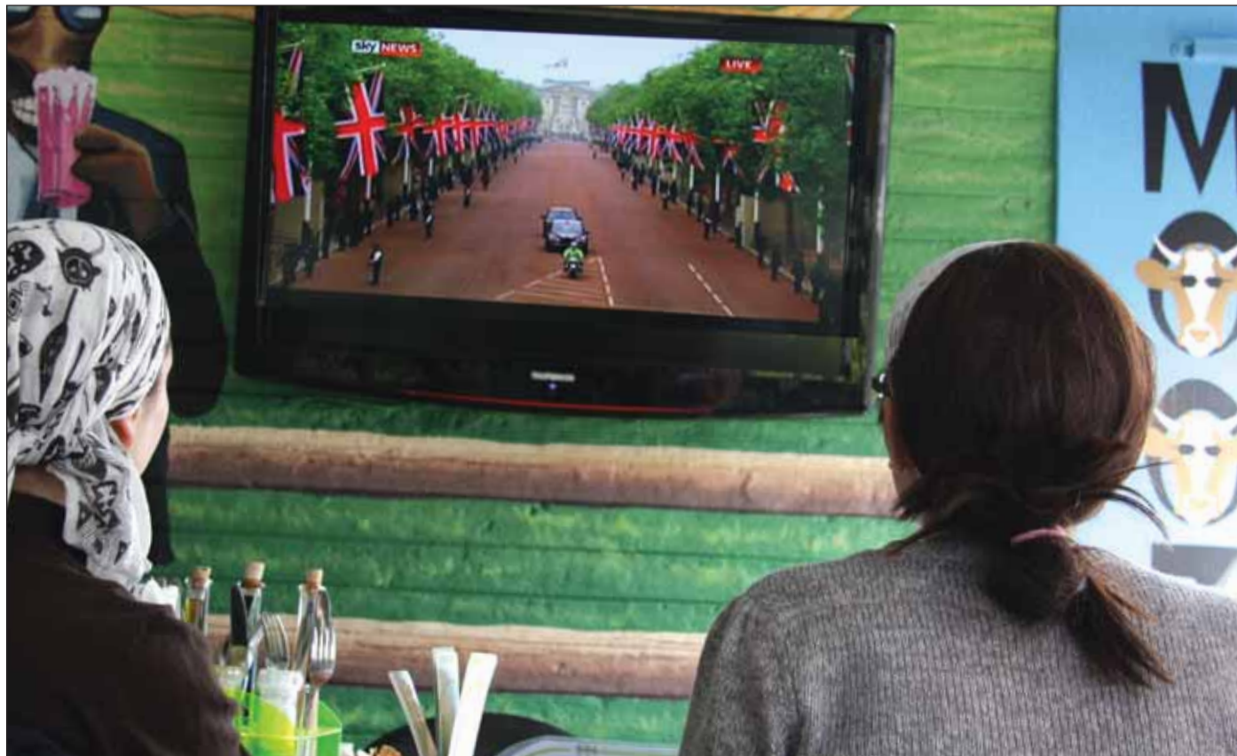
Transfixed by the romantic spectacle of the recent Royal wedding, two young observant Jewish women watch on the TV monitor at Mooz Bros kosher bakery/restaurant in Sandringham, Johannesburg last Friday.