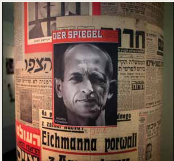
A portrait of Adolf Eichmann, in an exhibition marking the 50th anniversary of his trial in Jerusalem.