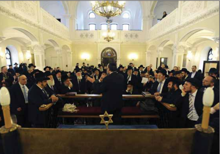
Conference participants in the Nozyk Shul, the only surviving shul in Warsaw after the war.

Although the conference had focused primarily on European issues, Rabbi Goldstein believed