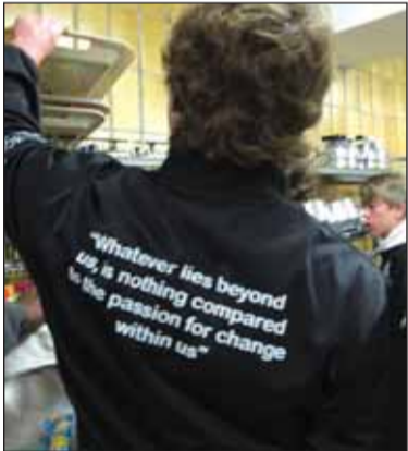
Junior and mini councillors spreading the message.