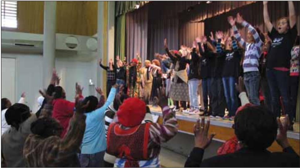
Everyone responds to the command, “Put your arms in the air”.