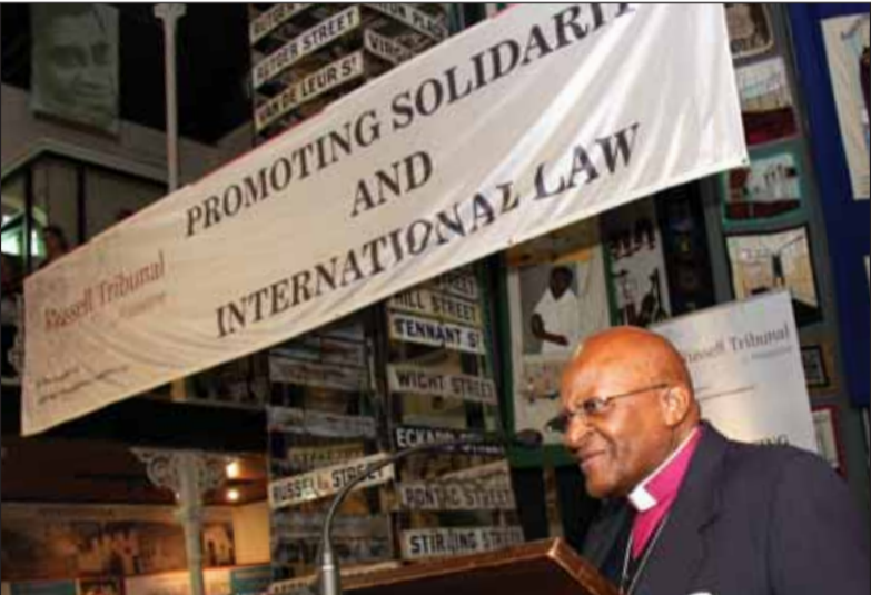
Archbishop Emeritus Desmond Tutu delivers his opening address at the Russel Tribunal.