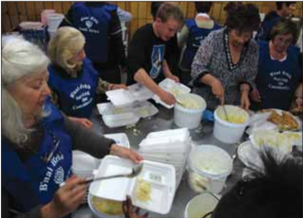
Dishing up the food for hungry guests.