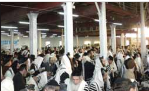
Kloiz Shul in Uman in the Ukraine erev Rosh Hashanah.

words of the shema in a Kloiz minyan of 7 500 people, far surpasses the euphoria of standing 10m from Spain as the (Soccer World Cup) trophy was handed to them (in 2010)."