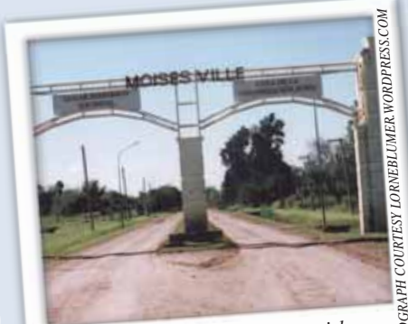
The entrance to Argentina's “Jewish Cow Town” Moiseville.

This emulates values central to a community with a fertile history, currently challenged from within and without.