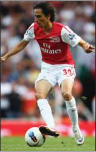
Yossi Benayoun has moved to Arsenal, but is still not spending too much time on the field for the Gunners.

It is an extraordinary feat to be part of three massive clubs of the likes of Liverpool, Chelsea and Arsenal. But sadly, Benayoun has done little playing for the last two, wasting the final years of his prime before the inevitable