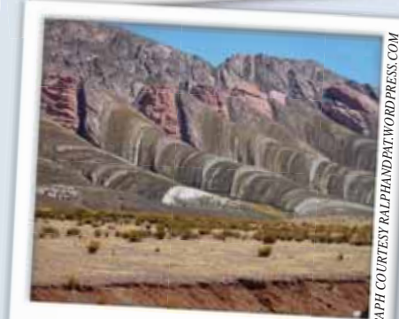
The mountains of northern Argentina.

JERUSALEM / TEL AVIV / EILAT / HAIFA DEAD SEA / TIBERIUS / GOLAN HEIGHTS