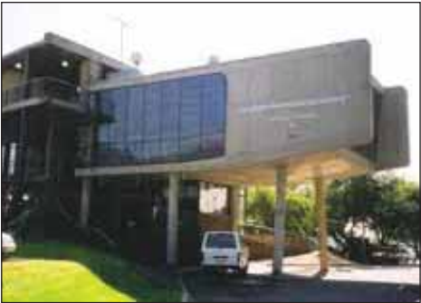
University of Pretoria's High Performance Centre.