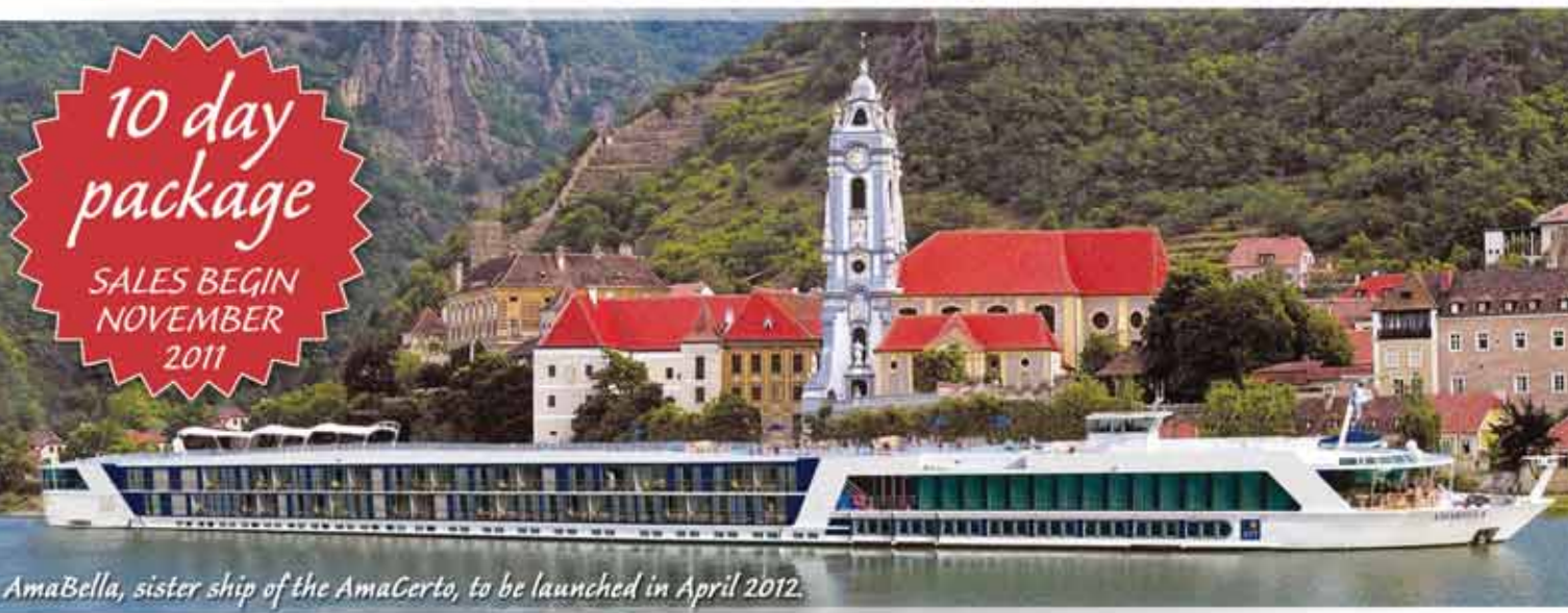
AmaBella, sister ship of the AmaCerto, to be launched in April 2012.

Combine the romance of the legendary Danube River with the unmistakable magic of Europe's most alluring capitals: Budapest, Vienna & fairytale Prague