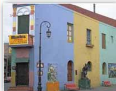
Buenos Aires, La Boca a must see.

From Buenos Aires – the Paris of the South with its great food, superb wine, sensual tango and fantastic shopping, to Rio – home of the Carnival, Sugarloaf Mountain and the Copacabana