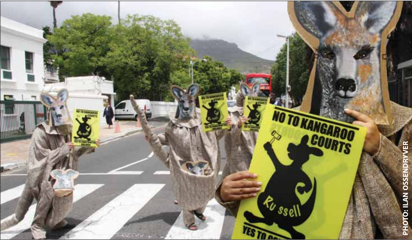
SAUJS students demonstrators at the District Six venue of the Russell Tribunal.