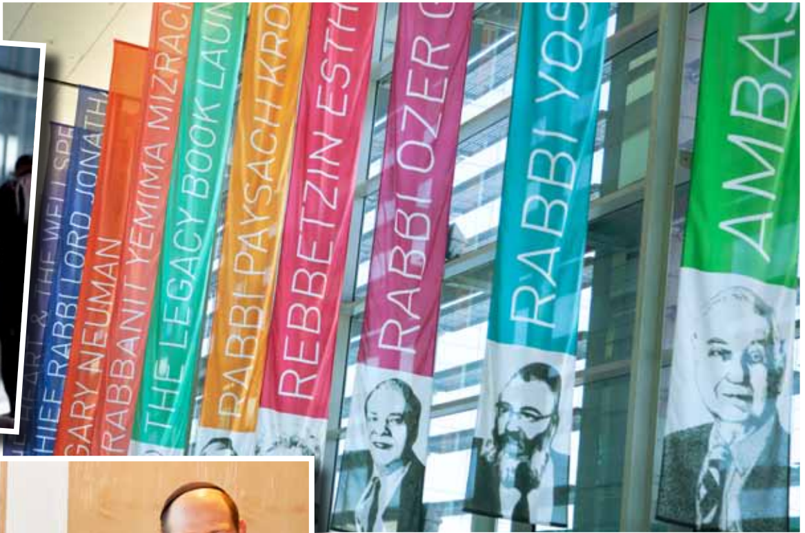
Musical entertainment by The Heart & the Wellspring