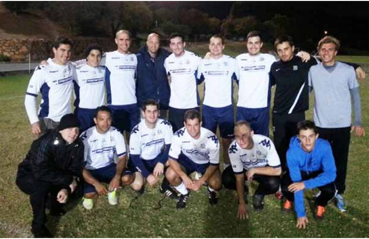
The Maccabi men’s open soccer team with Jordi Cruyff (back row, fourth from left) after their practice session at Mark’s Park in Johannesburg.

As the training sessions increase in strength and frequency, a host of other specialised coaches and staff such as Gavin Hunt and the Bidvest Wits fitness team come in to assist in ensuring that the players are well prepared for the tournament. The soccer teams have received fantastic support from their sponsors - Sasfin Bank, RAM Couriers and Bidvest. The teams need to go out and have fun, but if they are going to be successful, they will need to play through the pain.