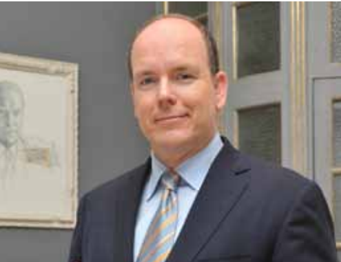
Prince Albert II