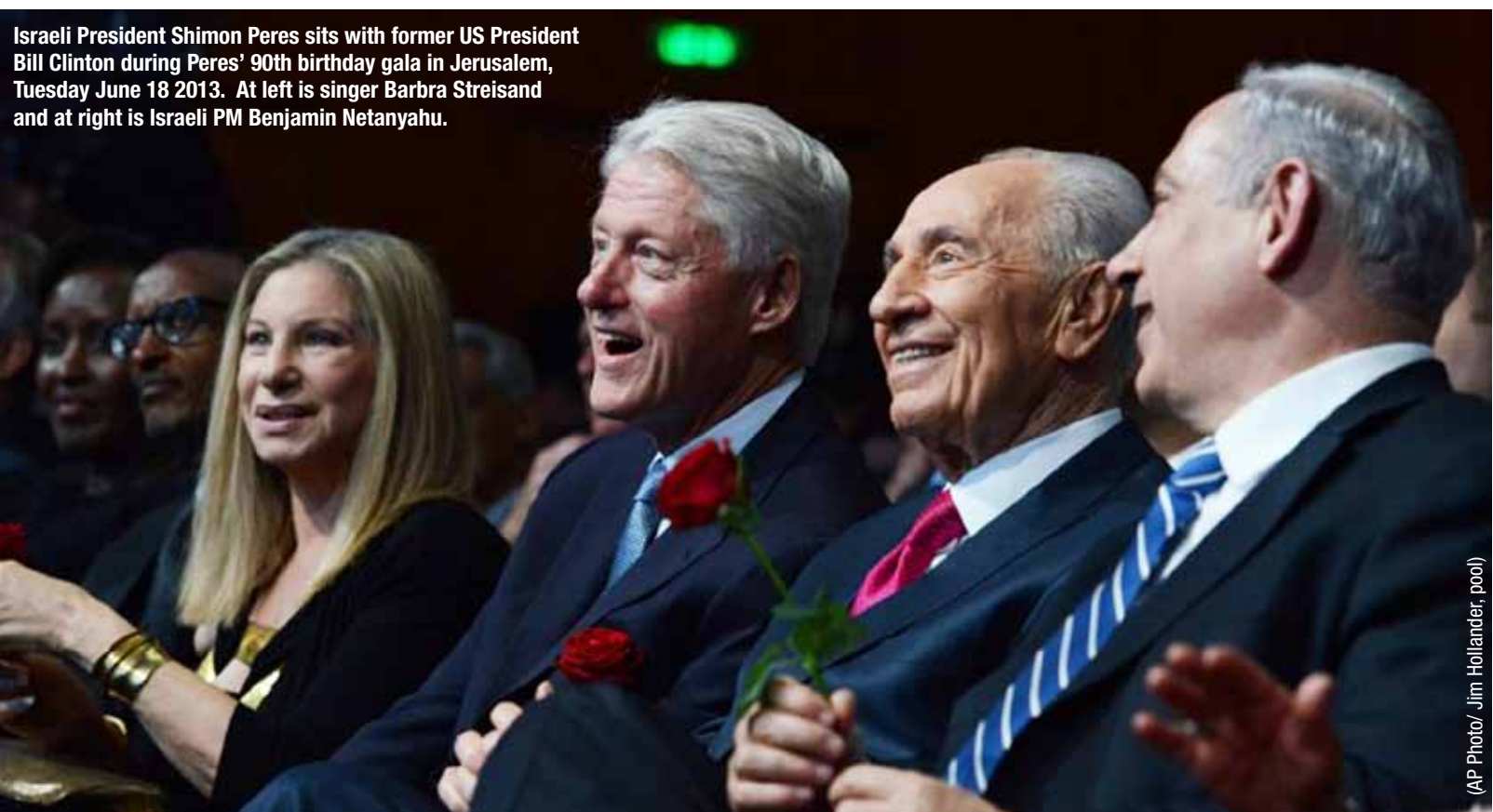
Israeli President Shimon Peres sits with former US President Bill Clinton during Peres’ 90th birthday gala in Jerusalem, Tuesday June 18 2013. At left is singer Barbra Streisand and at right is Israeli PM Benjamin Netanyahu.

JERUSALEM - Former US President Bill Clinton, Barbra Streisand, former UK Prime Minister Tony Blair, Sharon Stone and numerous other dignitaries and celebrities, headlined a gala event this week celebrating the 90th birthday of Israeli President Shimon Peres. The event was attended by more than 2 500 VIP guests. In addition to the numerous presentations, video birthday greetings were sent by US President Barack Obama, Secretary-General of the UN Ban Ki-moon, Nobel Prize-winning writer Elie Wiesel, U2 front man Bono, German Chancellor Angela Merkel, French President Francois Hollande, King of Spain Juan Carlos, Former Soviet Statesman Mikhail Gorbachev, and Russian President Vladimir Putin. The programme included numerous musical and dance performances by renowned Israeli artists, and was highlighted by Barbra Streisand’s moving performance of the Hebrew song, Avinu Malkeinu, Peres’ personal request. She also sang her classic song People.