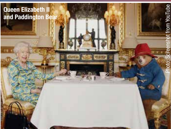
Queen Elizabeth II and Paddington Bear

Respected historian Andrew Roberts once said that the British government had a de facto ban in place on state visits by Queen Elizabeth II to Israel. “The true reason of course, is that the FO [Foreign Office] has a ban on official royal visits to Israel, which is even more powerful for its being unwritten and unacknowledged. As an act of delegitimisation of Israel, this effective boycott is quite as serious as other similar acts, such as the academic boycott, and is the direct fault of the FO Arabists. It’s therefore no coincidence that although the Queen has made more than 250 official overseas visits to 129 different countries during her reign, she has ever been to Israel on an official visit,” Roberts told attendees at a gala dinner in London.