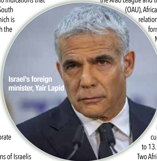
Israel's foreign minister, Yair Lapid

On 31 May 2022, Paris hosted a high-level meeting highlighting and promoting Israel's growing relations with African countries. Israel has much to offer the African continent, in the agricultural, innovation, and security sectors. Africa can offer Israel trading opportunities and diplomatic support. This meeting underscored progress and potential. The event was even attended by ministers or former ministers from countries that don't formally recognise Israel such as Mali and the autonomous region of Somaliland. There are no indications that it was attended by the South African government, which is notoriously wary of both the French and Israelis. Israel's foreign minister, Yair Lapid, said via video link, "We will co-operate to deliver food security for millions. We will co-ordinate in the fight against terrorism to ensure peace and stability. We will collaborate in high-tech to create opportunities for millions of Israelis and Africans alike. We will cultivate deeper diplomatic ties to cement our historic and deeply-rooted partnership." The event, titled "Israel back in Africa? Challenges and opportunities," was organised by the Israeli embassy