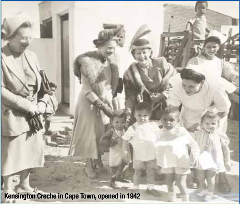
Kensington Creche in Cape Town, opened in 1942