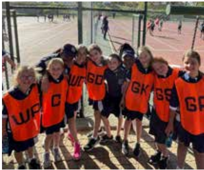
Yeshiva College Under-10 netball girls

Yeshiva College's Under 10 netball team won the District 9 League last weekend, in which more than 50 schools participated. Well done to the girls and coaches!