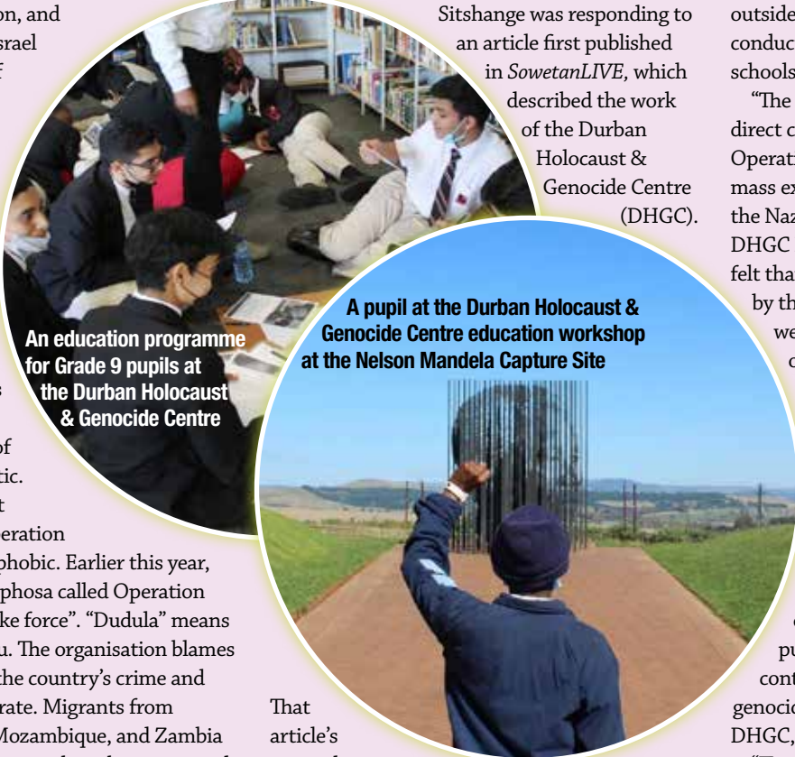
An education programme for Grade 9 pupils at the Durban Holocaust & Genocide Centre