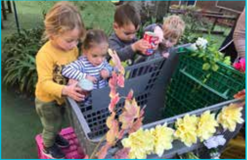
Sydenham Nursery School children giving bikkurim

Prior to Shavuot, Jewish schools collected bikkurim , which were donated to Yad Aharon & Michael and distributed to Jewish families in need of food, ensuring them a plentiful chag !