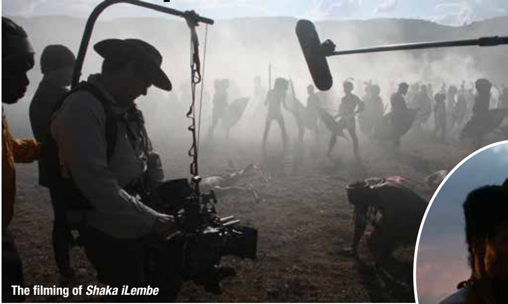
The filming of Shaka iLembe

“Habonim [Habo] gave me and my friends and