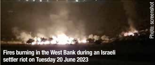
Fires burning in the West Bank during an Israeli settler riot on Tuesday 20 June 2023

publication Ynet . But that admonition appeared not to deter the rioters. As in February, according to reports in Israeli media, they torched at least one store as well as cars and agricultural fields, and threw rocks at Palestinians. The activity took place in multiple villages near Nablus, including Huwara, according to local media reports. Three Israelis were arrested for arson, and an Israeli soldier was seen firing in the air in an attempt to quell the riots. Since the beginning of the year, more than 100 West Bank Palestinians have been killed in Israeli military raids and more than 20 Israelis have been killed in Palestinian terror attacks.