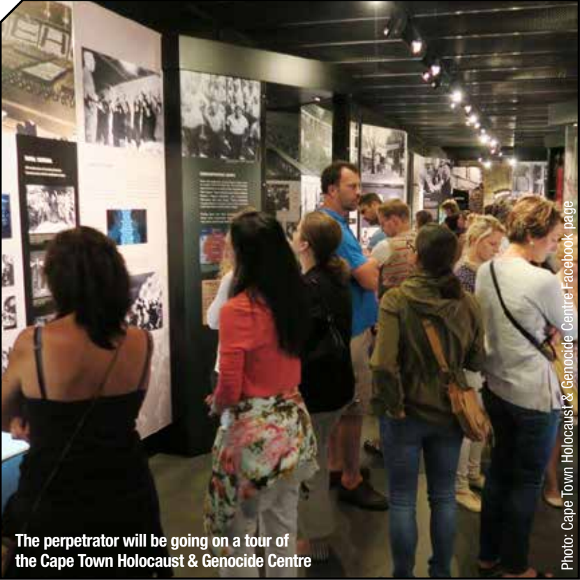
The perpetrator will be going on a tour of the Cape Town Holocaust & Genocide Centre