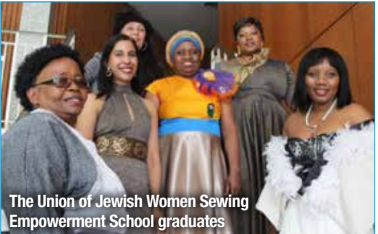
The Union of Jewish Women Sewing Empowerment School graduates

earn an income from work generated from selling items. Unemployed men and women are carefully screened and selected to undergo the four months of full-time training within a structured curriculum.