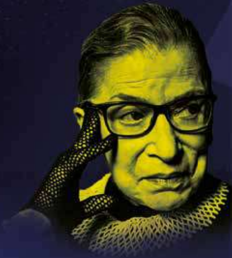
JUSTICE RUTH BADER GINSBURG