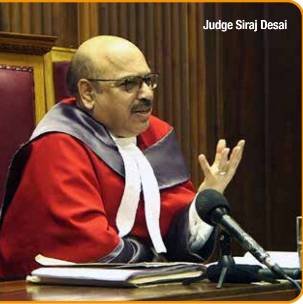
Judge Siraj Desai

appeal, it "must declare clearly for all judges that they may never publicly condemn the practice of apartheid or other international crimes, that they may never engage in extrajudicial activities to promote the realisation, and condemn the violation, of fundamental human rights". The appeal has yet to be set down for hearing.