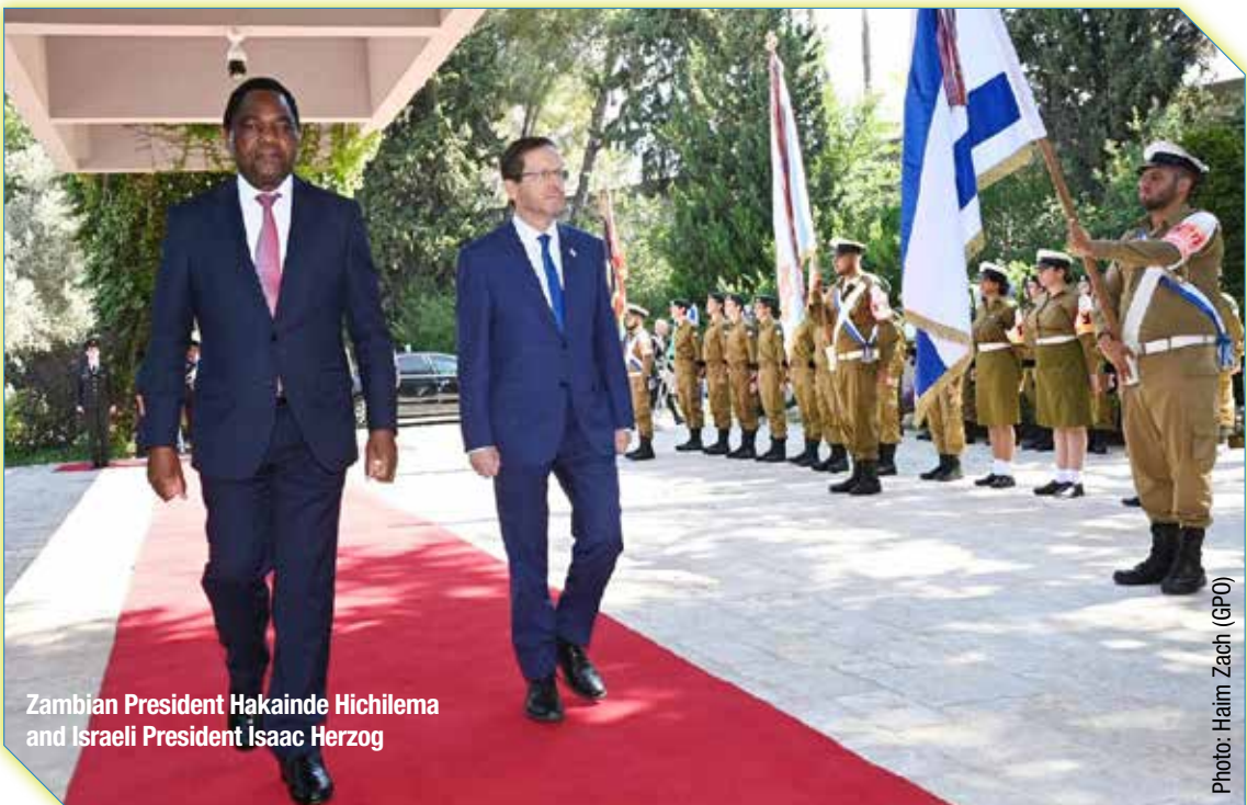
Zambian President Hakainde Hichilema and Israeli President Isaac Herzog

“Israel has proven to be an inspiring partner, willing to walk the journey with Zambia in igniting a future of innovation and