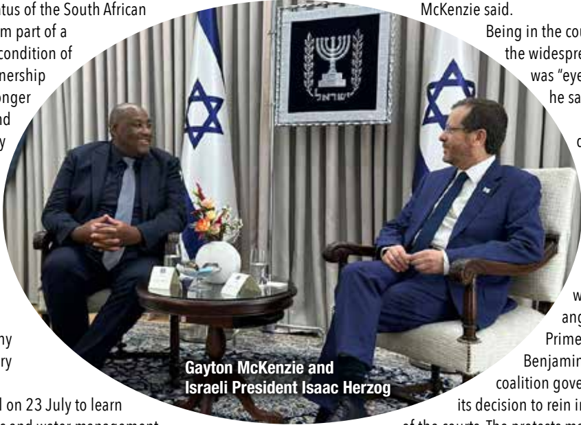
Gayton McKenzie and Israeli President Isaac Herzog

"So many of our towns and cities are losing half of the bulk water before it even reaches our residents for consumption. In Israel, they lose 2% at most, and process all the wastewater in a truly cyclical system. The sewage gets turned into fertiliser for farming, the wastewater is used for irrigation, and the sludge processing produces methane that powers 80% of the needs of the water treatment plant. Israelis don't waste anything. That's a powerful lesson for South Africa, whatever your politics may be," McKenzie said.