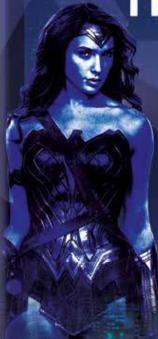
WONDER WOMAN GAL GADOT