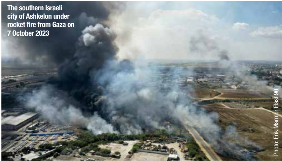
The southern Israeli city of Ashkelon under rocket fire from Gaza on 7 October 2023

Military scientists dissect and critically analyse battles in history