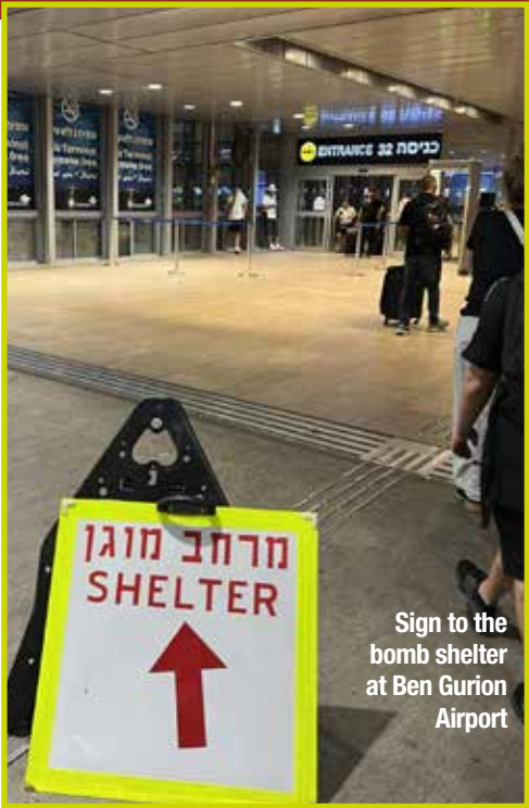
Sign to the bomb shelter at Ben Gurion Airport