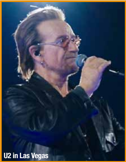
U2 in Las Vegas

On Instagram, Jewish comedian Sarah Silverman re-posted a note aimed at activists and others who have celebrated Hamas' violence. Broadway star and Grammy-winner Josh Groban re-posted a note from Israeli-