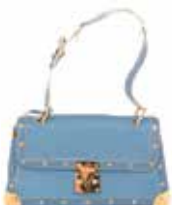
Louis Vuitton vintage 'Le Talentueux' blue leather shoulder bag SOLD R17 000