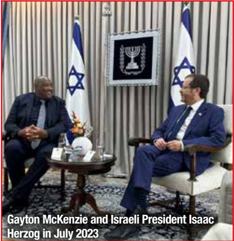
Gayton McKenzie and Israeli President Isaac Herzog in July 2023

The Democratic Alliance (DA) condemns Hamas' unprovoked attack on Israeli territory during the religious holiday of Simchat Torah. The DA urgently calls on the department of international relations and cooperation to condemn this unprovoked attack unequivocally, and join the international community in its call for an immediate end to the rapidly escalating violence. The DA condemns this senseless violence and all acts of terror against innocent civilians, women, and children, and calls for aggressors in this conflict to withdraw immediately.