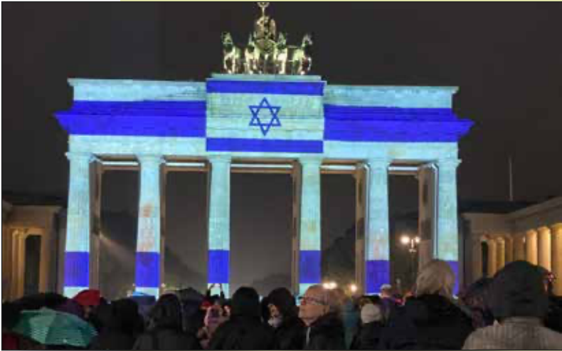
Germany showing support for Israel

in the south of Israel, where ordinary families were living their ordinary lives, being their ordinary selves, until terror and destruction hit? Only Jewish lives were brutally taken. The scope of the atrocities committed against ordinary Israelis, the degree of barbarity and savageness, was unprecedented. Even ISIS (Islamic State’s) terrorism pales in comparison to what Hamas did. But what’s no less important is the response of the civilised world. We heard country after country expressing shock at this heinous attack, offering sympathy and gestures of solidarity, as well as condemning Hamas unequivocally. A few, however, chose to disregard the facts, and conveniently blamed Israel in their statements, justifying terror, placing themselves in the camp of the perpetrators. Even more ridiculous are the offers of mediation between murderers and their victims, between savages who destroyed lives and their targets. This attitude is an insult to humanity. Unfortunately, Israel has always been the preferred choice for bashing by the so-called “politically correct supporters of the oppressed”. Accusations of Israel’s responsibility for all crimes possible and sometimes impossible are among the favoured pastimes of the self-righteous hypocrites.