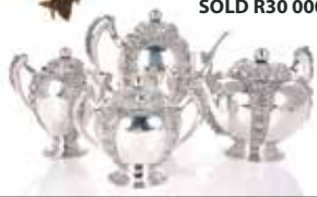
Portuguese silver .800 four piece tea service SOLD R30 000