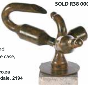
Edoardo Villa, Beno SOLD R38 000