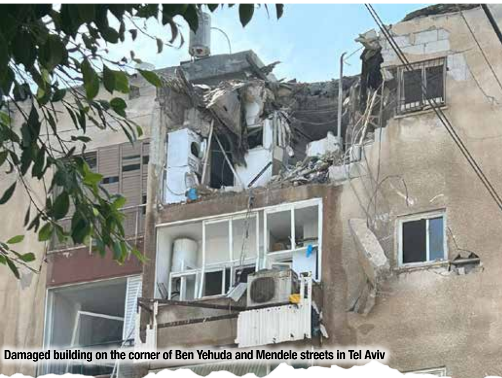
Damaged building on the corner of Ben Yehuda and Mendele streets in Tel Aviv