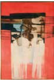
George Boys, First Light SOLD R17 000