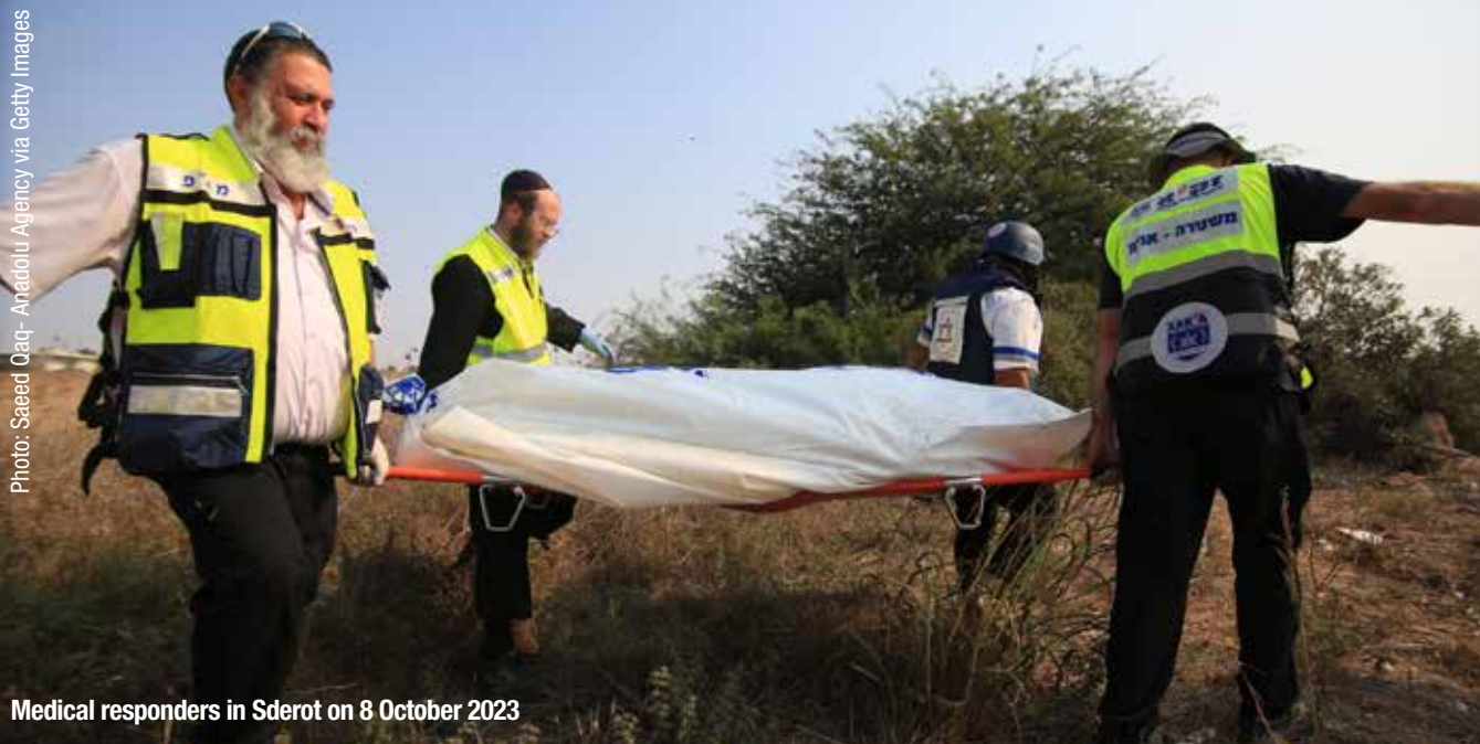
Medical responders in Sderot on 8 October 2023

But what do we do when Hamas terrorists who go from house to house, murdering innocent people, setting fire to homes, executing people in the street, slaughtering 260 at a peace party, and kidnapping nearly 200, infiltrate our peaceful southern towns and kibbutzim? These are the scenes from horror movies. Except they aren't. This is our reality, and we're all struggling to absorb it. We cannot. By now, we're starting to know the names of the dead.