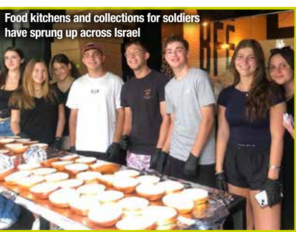
Food kitchens and collections for soldiers have sprung up across Israel

We felt shock when awakened by alerts on our phones, immediately viewing real-time images and videos of the atrocities happening down south.