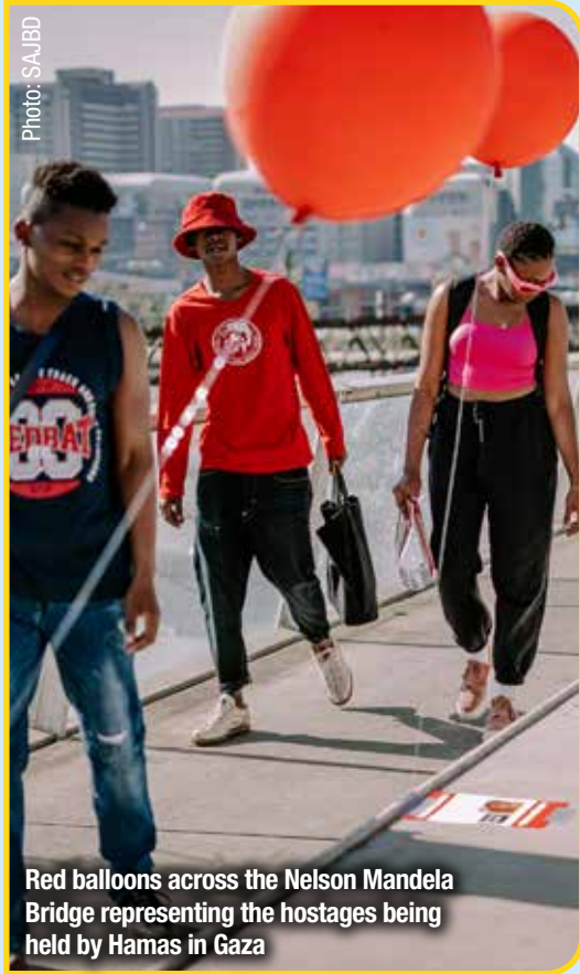
Red balloons across the Nelson Mandela Bridge representing the hostages being held by Hamas in Gaza

The Nelson Mandela Bridge itself is in a parlous state – begrimed by graffiti, with several of its glass panels shattered, lying on the bridge, or entirely missing. It's a symptom of a slowly decaying, neglected inner city. It made a fitting site for the sadness surrounding the fate of the kidnappees.