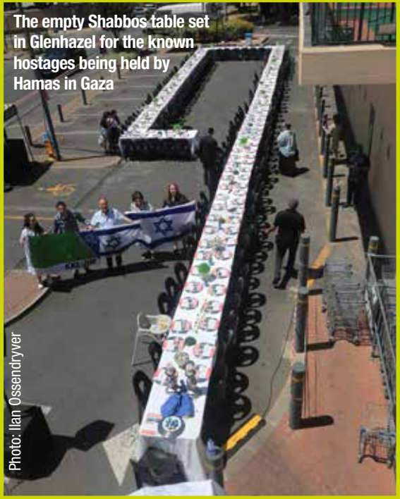
The empty Shabbos table set in Glenhazel for the known hostages being held by Hamas in Gaza

held against their will, and we're crying for the fighting that continues. We're asking G-d to intervene and bring peace to Jerusalem."