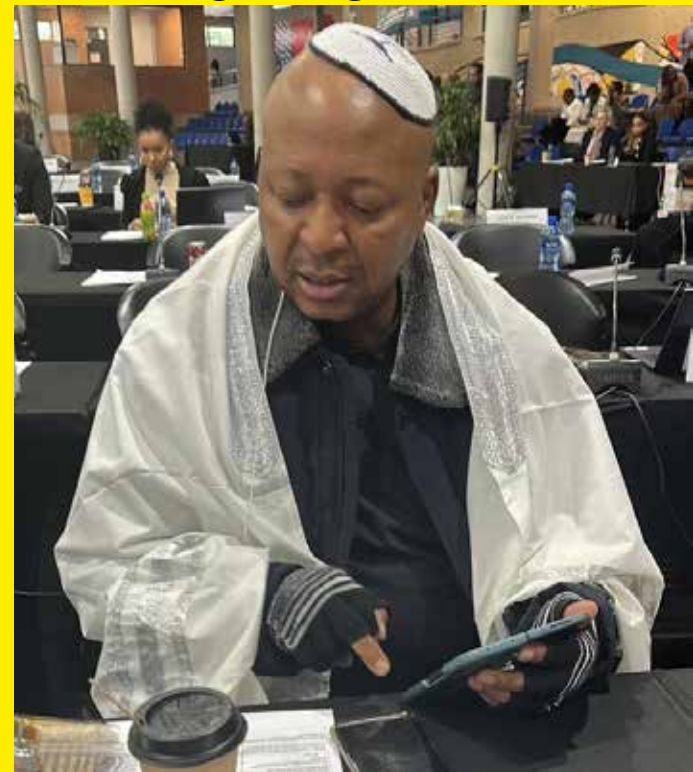
Mayoral committee member for roads and transport, Kenny Kunene, made it clear that he stood with the Jewish community by donning a kippah and tallis at a Johannesburg city council meeting on 1 November.