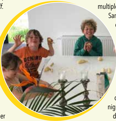
Jews around the world taking part in the Shabbos Project

invitation Shabbat meals will be held in multiple apartment blocks; and San Diego, where innovative events including a Shabbat shuk and a Shabbat meditation workshop are expected to reach thousands of Jews across the political and religious spectrum. Elsewhere, a community-wide Friday night dinner in Tokyo will be dedicating proceeds towards Israel, and, perhaps most remarkably, in Guadeloupe, an island territory in the Caribbean, the entire community has pledged to keep Shabbat in solidarity with Israel.