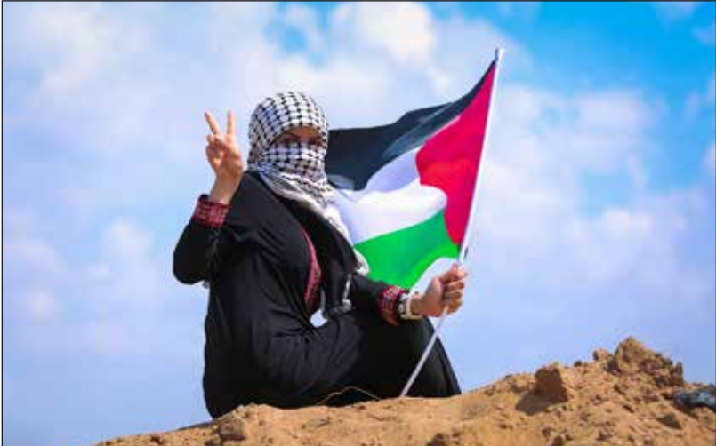
There will be administrative changes in Gaza once the war is over

2. Leave Gaza to its own devices This is the other extreme – Israel simply withdraws again after the war is concluded, without any structured solution. This also isn’t a serious option. It’s generally the case that the Middle East abhors a power vacuum, and