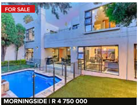
≔ з 2.5