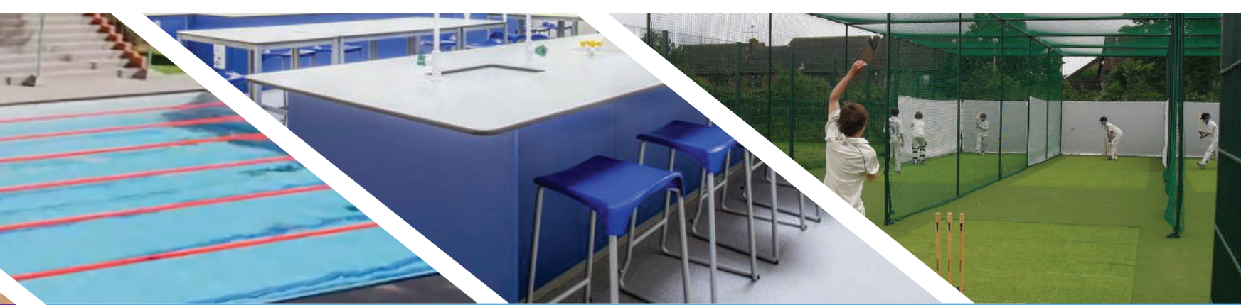
KING DAVID PRIMARY SCHOOL LINKSFIELD Swimming pool upgrade, science lab & upgraded sports facilities