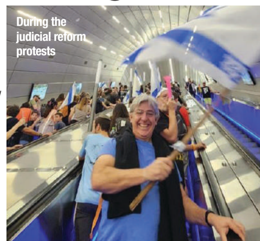
During the judicial reform protests