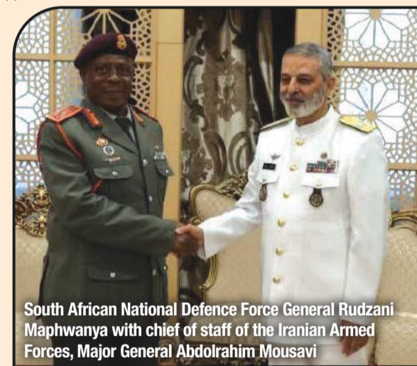
South African National Defence Force General Rudzani Maphwanya with chief of staff of the Iranian Armed Forces, Major General Abdolrahim Mousavi

Hattingh said "publicly embracing a sanctioned regime with a track record of regional destabilisation" would only deepen South Africa's "diplomatic isolation, risk retaliatory measures, and worsen our economic vulnerabilities".