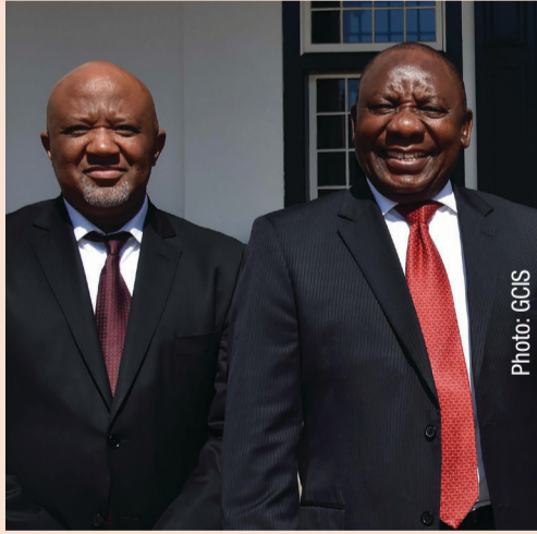
Mcebisi Jonas and President Cyril Ramaphosa