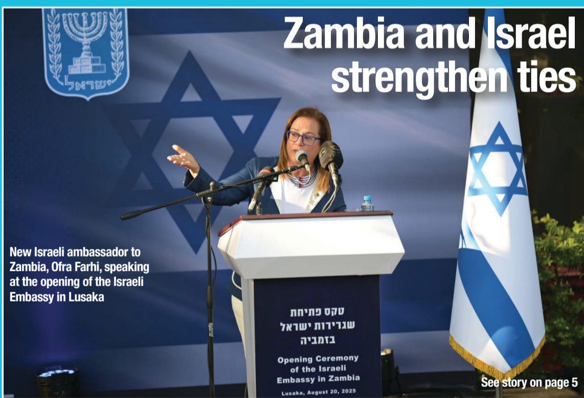
New Israeli ambassador to Zambia, Ofra Farhi, speaking at the opening of the Israeli Embassy in Lusaka