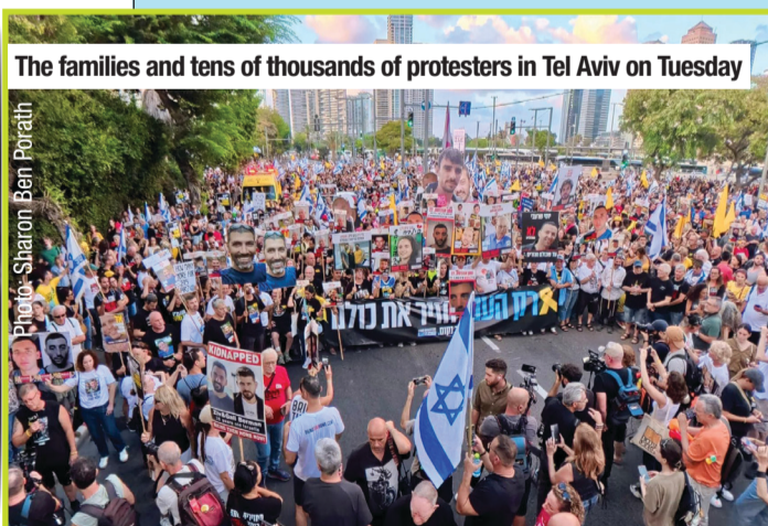
The families and tens of thousands of protesters in Tel Aviv on Tuesday