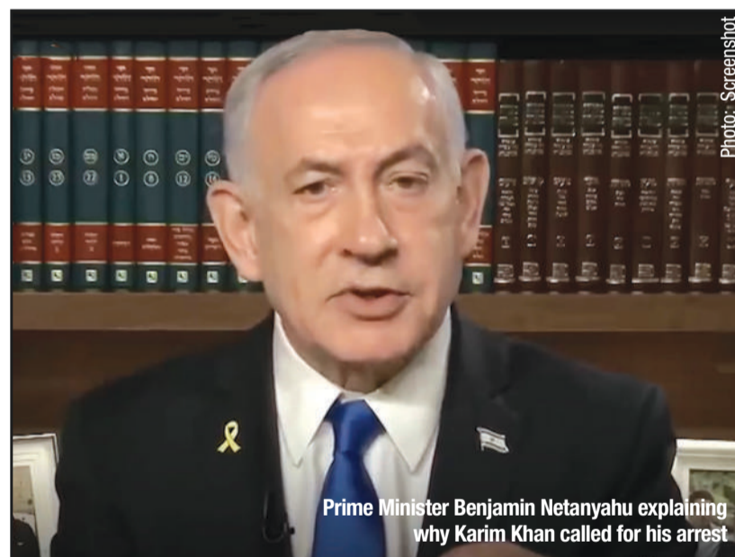
Prime Minister Benjamin Netanyahu explaining why Karim Khan called for his arrest

It's notable that events related to the ICC's Venezuela investigation have further called Khan's ethics into question. In late April 2024, Khan issued a glowing press release complete with happy photos following an official visit to Venezuela, where he concluded a co-operation agreement with the country's ruling dictator, Nicolás Maduro. The visit and amicable tone stood in stark contrast to Khan's treatment of Israel during that same time. It turns out that Khan's sister-in-law was a member of Venezuela's legal team at the ICC. Noting this blatant conflict of interest, in November 2024, a non-governmental organisation (NGO) filed a petition demanding that Khan recuse himself from the case, but he refused. In August 2025, an appellate chamber, agreeing with the NGO, ordered Khan to step down, and on 18 August, Khan tendered his withdrawal. Khan, however, rather than accepting the decision graciously, used these events to cast aspersions on the NGO which sought his recusal, and to imply a link to Israel.