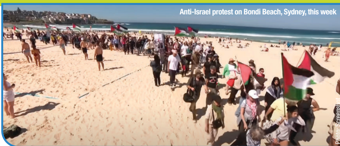
Anti-Israel protest on Bondi Beach, Sydney, this week

I was in Bondi – Sydney’s famous beachside suburb – waiting to drive into a parking-lot. A car was blocking the entrance. It was stationary, and the driver had abundant space in front of him. I rolled down my window and politely asked, “Could you move forward please?”