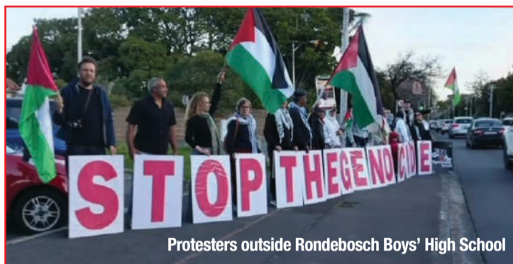
Protesters outside Rondebosch Boys' High School