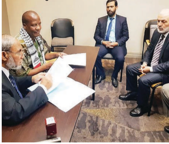
Hamas meeting the ANC in 2018

test for improving relations with the US?"