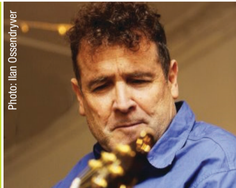
Johnny Clegg