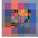
Paul Blomkamp, Simple Quantum Ciphers (4) R40 000 - R60 000