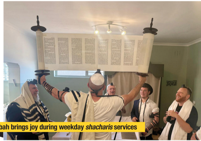
Hagbah brings joy during weekday shacharis services

Already, interest has begun to spread. Congregations