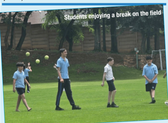
Students enjoying a break on the field