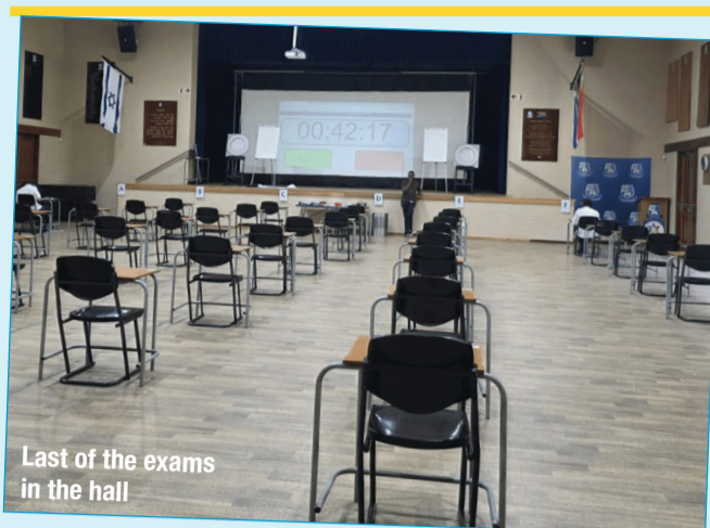
Last of the exams in the hall