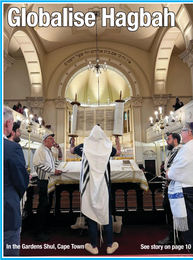
In the Gardens Shul, Cape Town See story on page 10