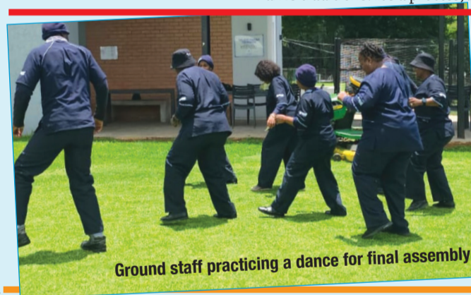
Ground staff practicing a dance for final assembly

"Though there was deep sadness and nostalgia about the closure in the past, we have finished grieving and have fully embraced the new reality," he said. "There is constant conversation about the new campus life and their sibling camaraderie, and all are excited to be part of this new and happening campus life with all its facilities and opportunities. There is natural trepidation about the exact transport plans, traffic, and class placements, but that will calm as the weeks progress."