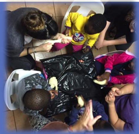
Baby's Home Challa Bake

On Friday November 11th, Jews all over the world took part in the Shabbat Project. Ten projects across the globe decided to do an interfaith Challa Bake. In Durban we went to DOMINO Foundation Baby's Home (An orphanage) to share the experience with them. The children learned how to braid dough & got to decorate their own challa and eat it!